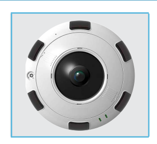
EXCA360IP12-SD Series 12MP 360° Surround View IP Camera